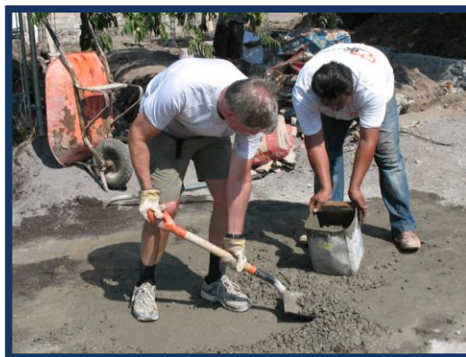
Mixing and packing concrete in doing the new construction for our home called "Las Golondrinas."