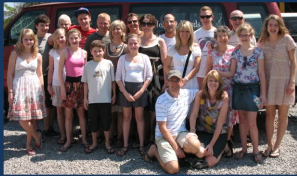
This family representing 3 generations came and did construction, kids clubs, plus more