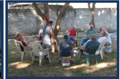
Waiting for concrete to pour sidewalks behind the Casa Cuna